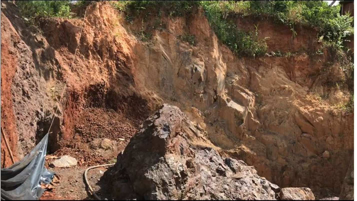
Figure 3: Underground workings at Luna Roja