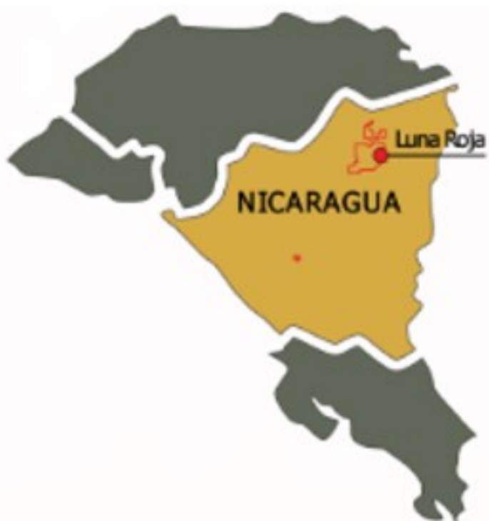
Figure 1: Location of the Luna Roja Gold Project

On the third and final day of my site visits with Royal Road Minerals Ltd (CVE:RYY), we went to visit the Luna Roja Gold Project. Luna Roja is located around 30 minutes' drive, on unsealed roads northeast of the town of Rosita (Figure 1).